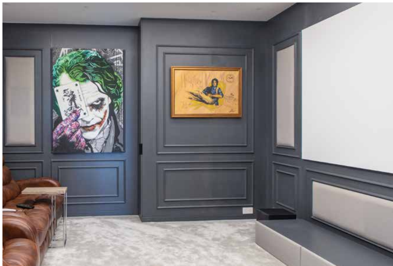
“The media room is a particularly successful space as, previously, this was a windowless open-plan dining room”